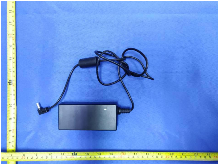
Photo 2: IP4X test of model GTM91099-6015-3.0-T2