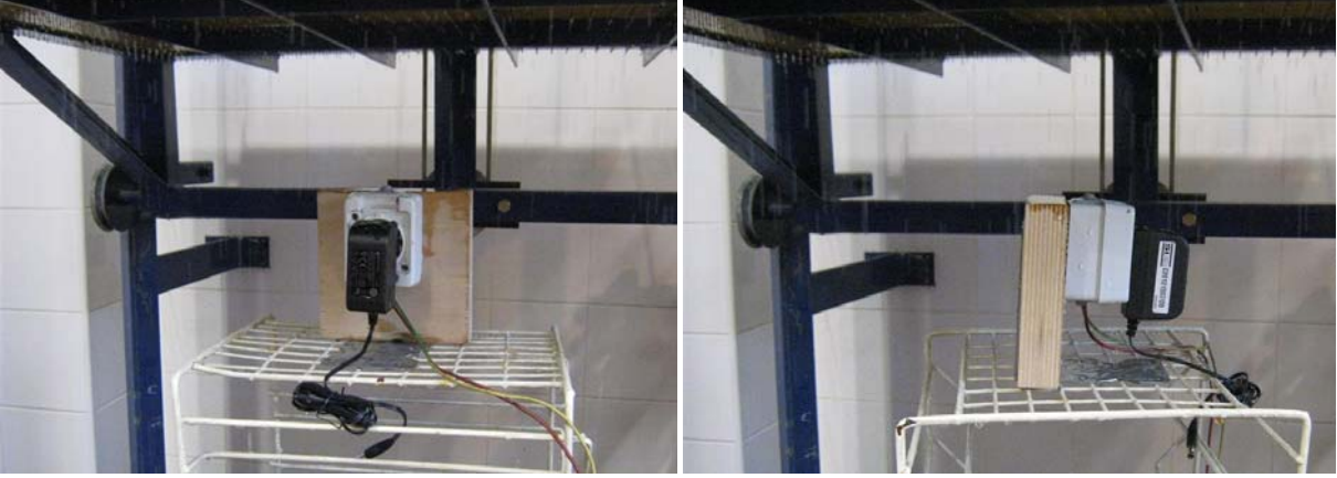
Figure 5 Figure 6

Conclusion: After the water test there was no water inside the enclosure (Figures 7 and 8).