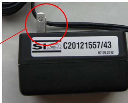
Figure 4: sample unit