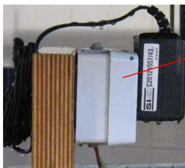
Figure 3: sample unit

During the testing the power supply was connected to the socket outlet, see Figure 3. The plug part (Figure 4) with the socket outlet was not subject of the test. Test results do not relate to the whole power supply but only to the enclosure (without the plug part).