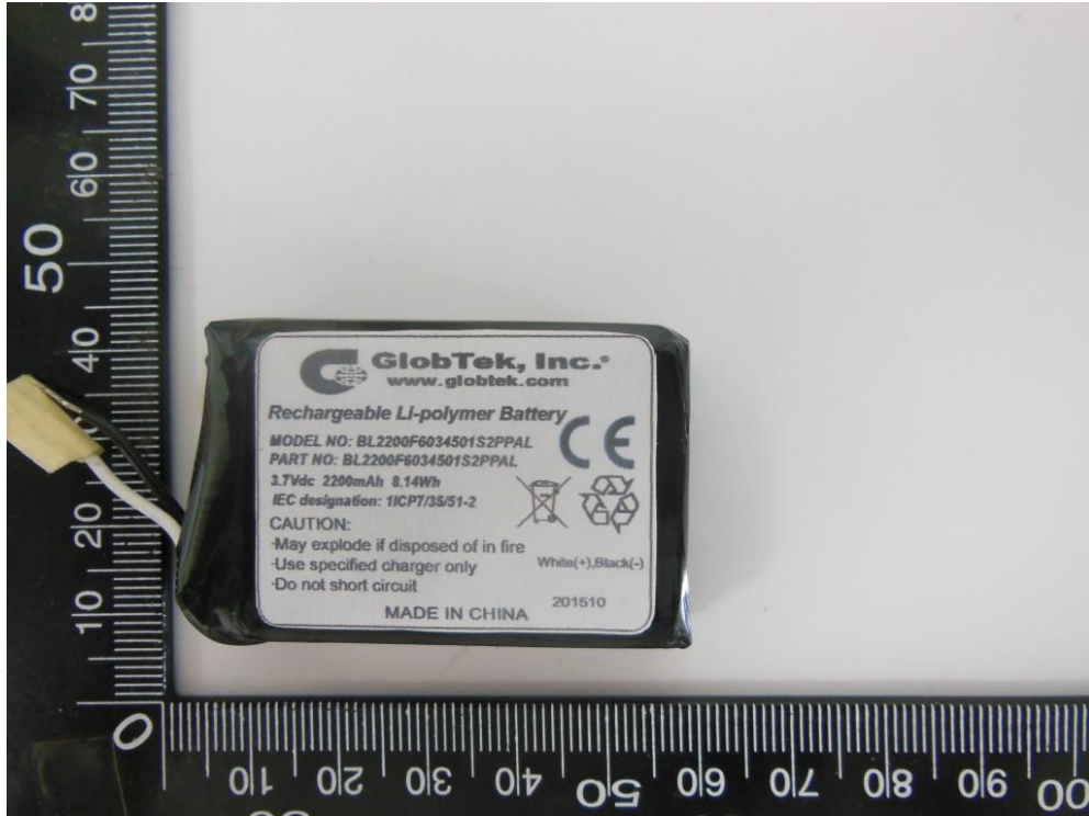
Rechargeable Li-polymer Battery /可充电锂聚合物电池 (3.7Vd.c., 2200mAh, 8.14Wh)