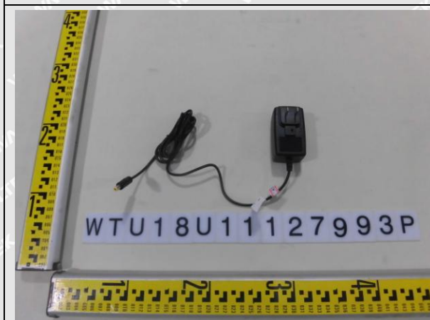
Power supply (GTM96180)