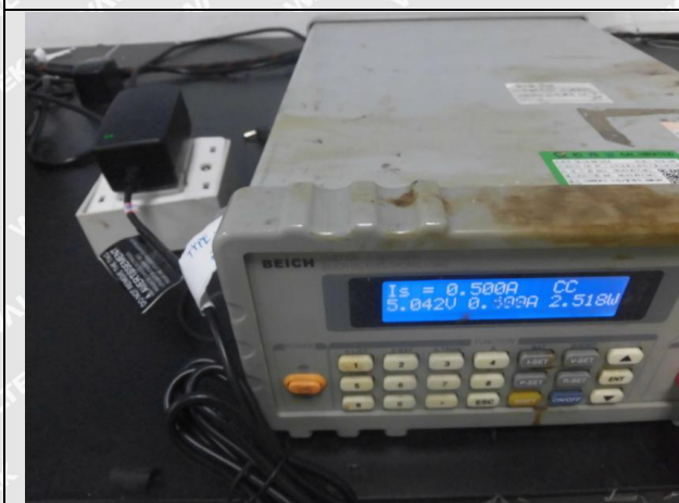
Function test (GTM96180)