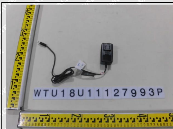
Power supply (GTM96180)