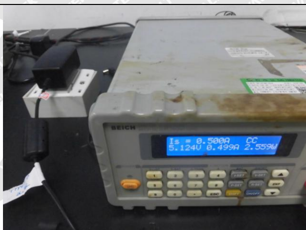
Function test (GTM96180)