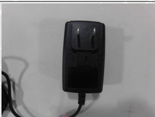
Power supply (GTM96180)