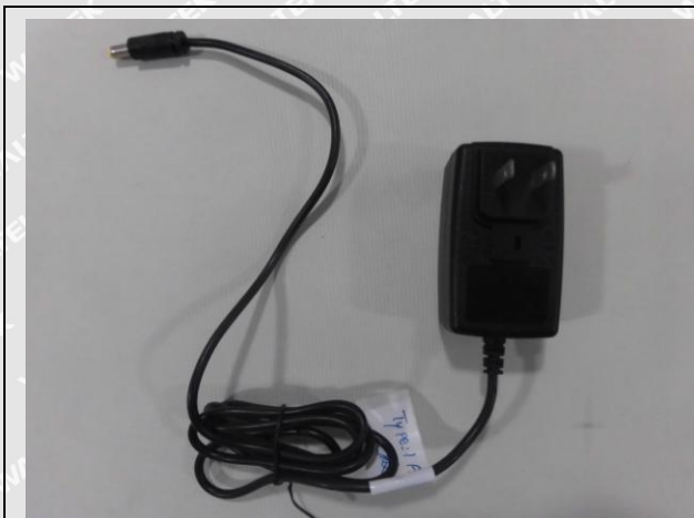
Power supply (GTM96180)