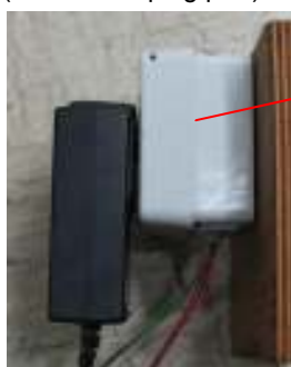
Figure 4: sample unit

During the testing the power supply was connected to the socket outlet, see Figure 4. The plug part (Figure 5) with the socket outlet was not subject of the test. Test results do not relate to the whole power supply but only to the enclosure (without the plug part).