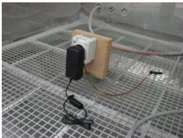
Figure 6: EUT before the dust test