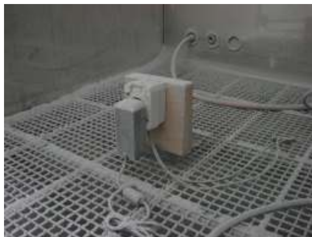
Figure 7: EUT after the dust test