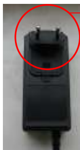
Figure 5: sample unit