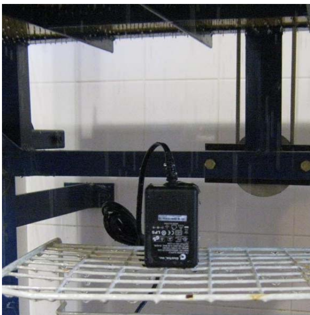
Figure 3: Test position