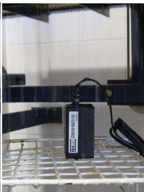
Figure 4: Test position

Conclusion: After the water test there was water inside the enclosure (Figures 5 and 6).