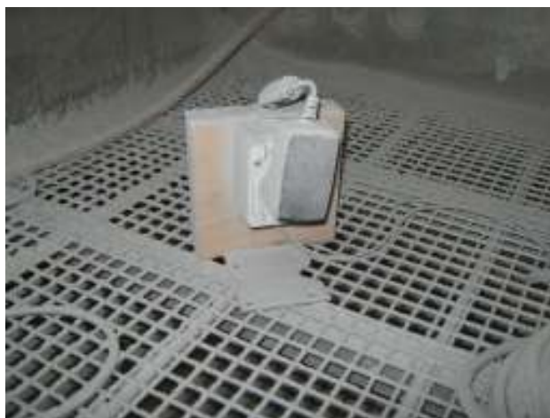
Figure 5: EUT after the dust test