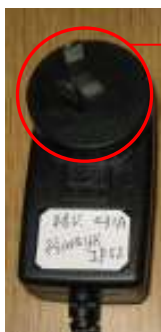
Figure 3: sample unit