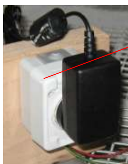
Figure 2: sample unit

During the testing the power supply was connected to the socket outlet, see Figure 2. The plug part (Figure 3) with the socket outlet was not subject of the test. Test results do not relate to the whole power supply but only to the enclosure (without the plug part).