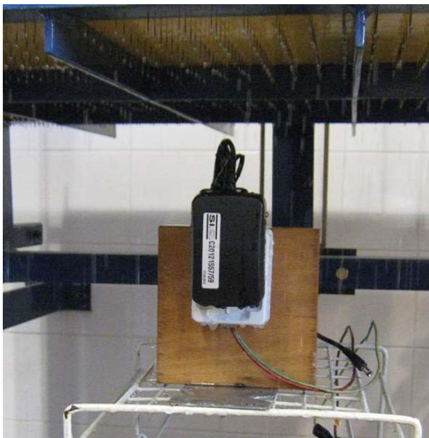
Figure 4: Test position