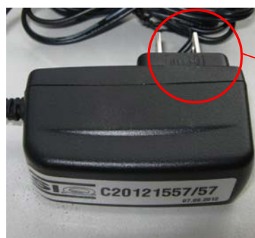
Figure 4: sample unit