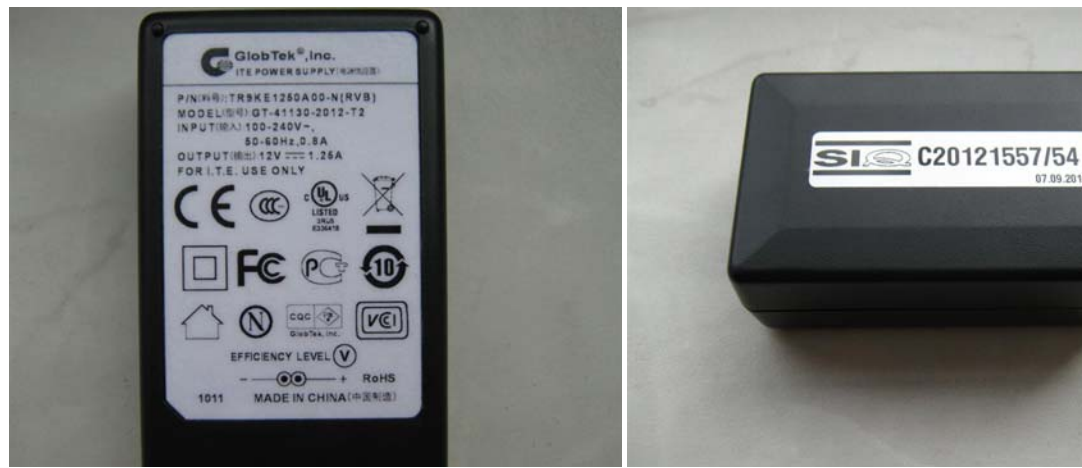
Figure 1 Figure 2

Power supply, model GT-41130-WWVV-X.X-T3 series, GT-43006-WWVV-X.X-T3 series, GT-41062-WWVV-X.X-T3 series and GT-41082-WWVV-X.X-T3 series, enclosure TR9KE1250A00-N(RVB) was subjected to testing for IP41 degree of protection (Figures 1 and 2).