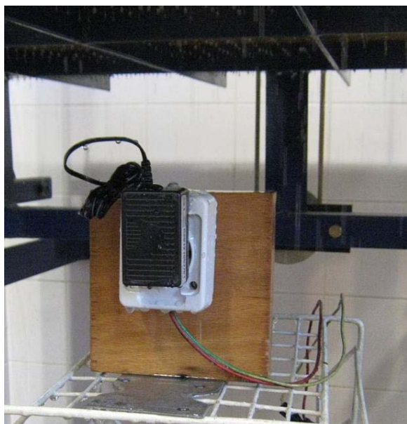
Figure 4: Test position