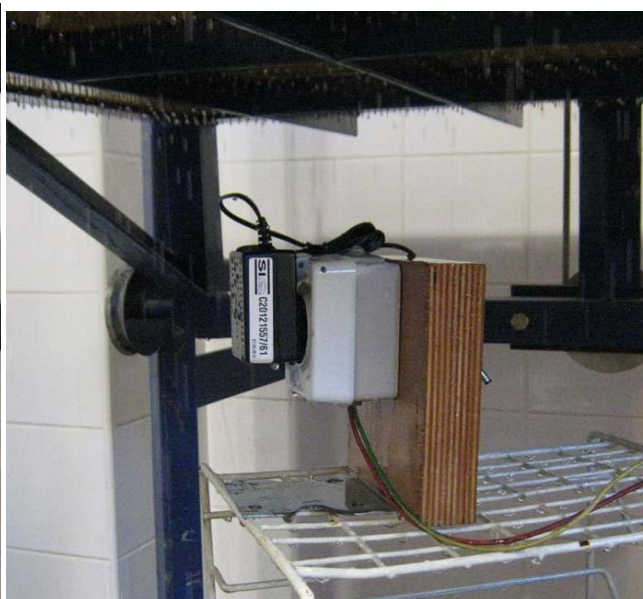
Figure 5: Test position

Conclusion: After the water test there was water on the appliance pins (Figure 6).