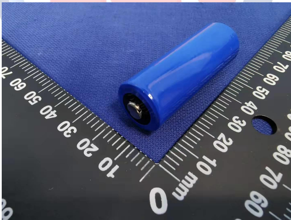
Picture 2. Cell view 图片 2. 电池视图